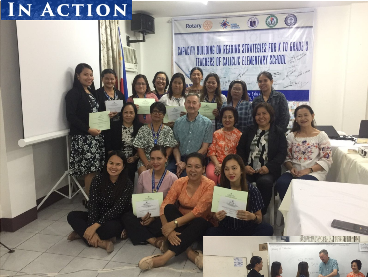
“Capacity building on reading strategies for K to Grade 3 Teachers of Balite Elementary School, Caliclic Elementary School and Tibungco Project Hope Day Care Center” Jan. 22 – 24, 2020 held at Brokenshire Resort Hotel Feb. 20-22, 2020 held at Brokenshire Bahay Alumni

Series of activities under Rotary Foundation Global Grant #1640035, A project on Rotary's Areas of Focus: Basic Education & Literacy and Maternal & Child Health Project